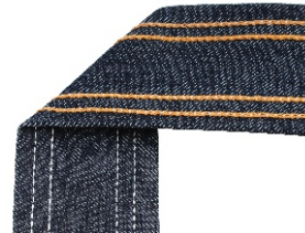
Waist band JK-8009HF